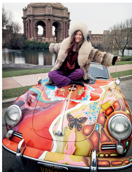
Above Janis and her beloved psychedelic Porsche in front of the Palace of Fine Arts, in San Francisco's Presidio Park.